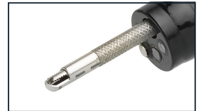
POWERED ENDOSCOPIC DEBRIDEMENT CATHETER