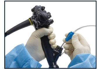
CONTROL KNOB FOR 1:1 ROTATION