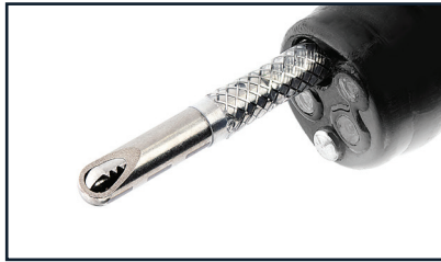
ENDOSCOPIC POWERED RESECTION CATHETER

Used clinically to facilitate removal of lateral margins and tissue bridges post-EMR.